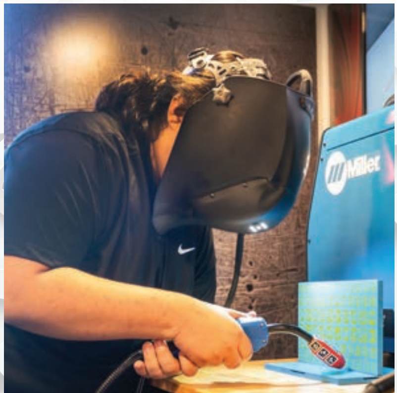
CLOCKWISE FROM TOP LEFT: Multiple interactive exhibits are available within the traveling career center. Examples include construction, working on electric lines, welding and operating heavy equipment.